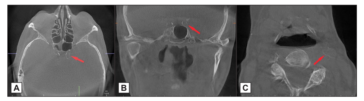
Figure 2. Atheromatous calcifications (red arrows). A and B intra-cranial localization; C = extra-cranial localization.