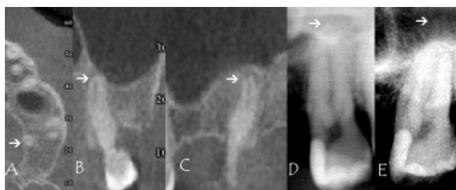
Figure 1. An example of no protrusion of tooth #27 palatal root tip (arrow) in the maxillary sinus according to cone beam computed tomography scans assessment: A = axial slice; B = coronal slice; C = sagittal slice. Tooth root #27 overprojection onto the maxillary sinus floor using orthopantomogram images (D) and periapical radiographs (E).

of Amsterdam) who did not participate in the observations. The observers were blinded to the patients' biographic data including name, gender and age. The observers were calibrated by training them in the radiographic features for identifying the relationship of the teeth roots to the inferior wall of the maxillary sinus. The identifying radiographic feature in all imaging modalities was to assess whether the apical root tip of right and left first and second premolars, first, second and third molars is over (in), against (doubtful) or under (out) the white line depicting the inferior border of the maxillary sinus. The observers assessed first the conventional PA radiographs and OPG and then the CBCT images. All measurements were made with consensus among the four observers. Radiographs were displayed under standardized lightening conditions of reduced dim light on a 21-inch flat-panel screen (resolution 1680 x 1050, Philips Brilliance, Amsterdam, Netherlands). The PA radiographs and OPG images were displayed using Emago imaging software (v.5.4, Amsterdam, Netherlands) (Figure 1). The CBCT images datasets were reviewed using the NewTom 3G software (v.2.17, Verona, Italy). Multiplanar reformatted reconstructions in the axial, coronal and sagittal planes were created and the relationship of the teeth root tip