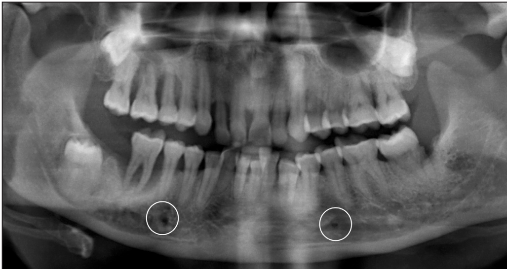
Figure 1. Panoramic radiograph showing irregularly shaped, symmetrical mental foramina.