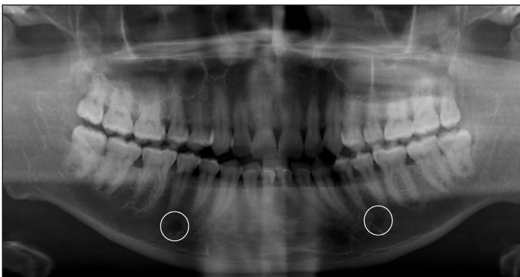
Figure 3. Panoramic radiograph showing uniformly circular, symmetrical mental foramina.