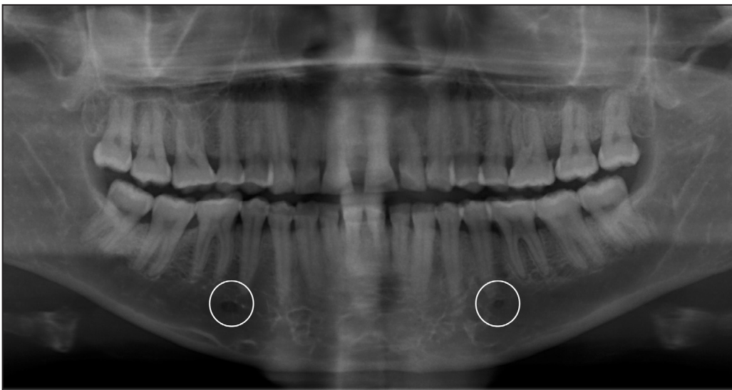
Figure 2. Panoramic radiograph showing ovoid shaped, asymmetrical mental foramina. The mental foramen were deemed asymmetrical due to the variations in the vertical position of the right and left foramen.