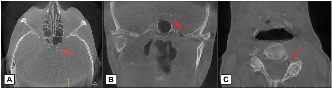
Figure 2. Atheromatous calcifications (red arrows). A and B intra-cranial localization; C = extra-cranial localization.